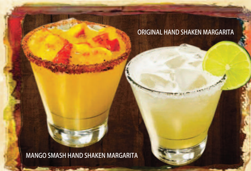
MANGO SMASH HAND SHAKEN MARGARITA

Tanteo Jalapeno Tequila, Cointreau Orange Liqueur, agave nectar and fresh lime juice. Spicy! Served in a rocks glass. 15